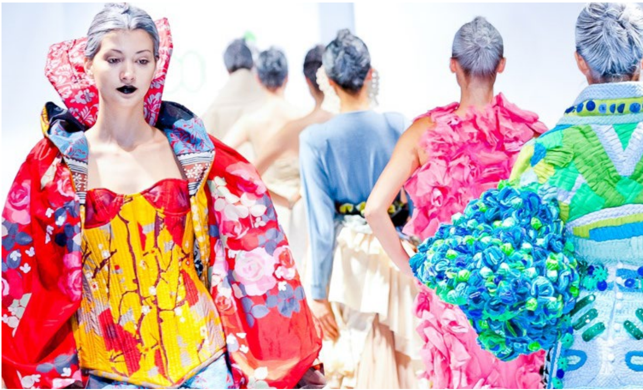
Up-cycled outfits in the finale at 'Redress on the Runway'.